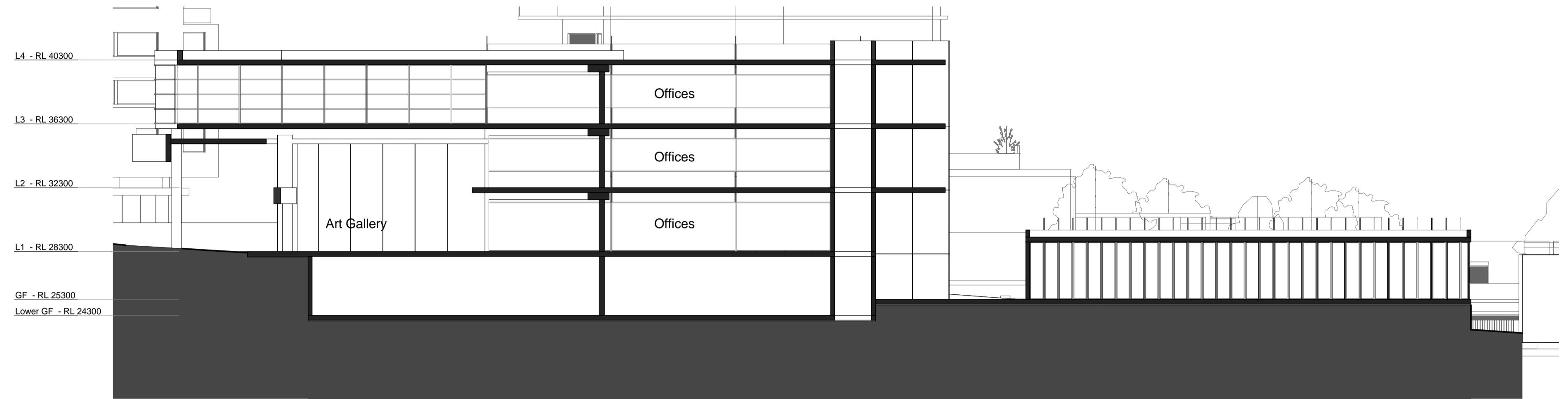
2 Section 02 1:200